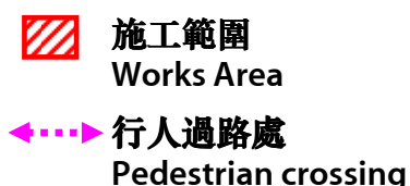
海泓道第三階段土力加固工程前期工序 (由2011年11月中旬至12月下旬) Advance Works for Stage 3 Ground Treatment Works at Hoi Wang Road (From mid November to late December 2011)